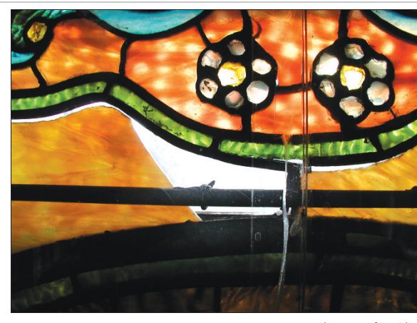
Broken glass with detached wire tie.

The Tiffany-like figural window shown above (which is 10' H x 6' W) is a wonderful example of a magnificent panel that once graced a mansion in Tarrytown at the turn of the (19th) century. Prior to the buildings' demolition, the window was salvaged. It was later installed in another residence during the 1960s. Today, there are numerous problems: daylight showing, poor earlier repairs, broken and missing lead and putty, mismatched glass, failed support bars, and serious bowing. After five decades of no maintenance, it is currently being fully restored at our studio. The detailed images to the right show some of the problems listed in the checklist on the previous page, along with a repaired section.